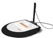
ImageSign Pro® eSignature Series