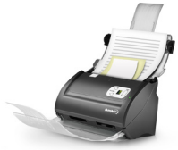
The ImageScan Pro® 800 series

Trusted in healthcare, enterprise, banking, SMB, and government offices across the country, the Ambir hardware and software portfolio has a proven record of quality and durability among end users.