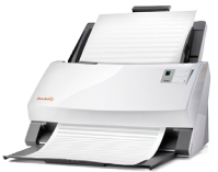
The ImageScan Pro® 900 series